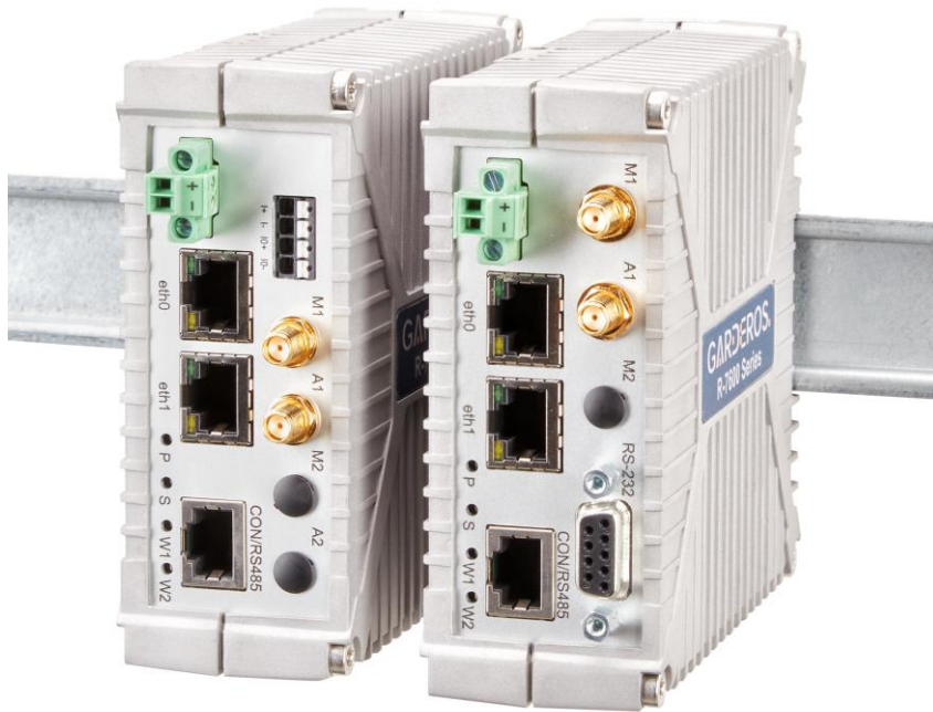
Fig. 1: Garderos R-7600 single radio routers optimized for smart grid.

Garderos routers provide cyber-secure and reliable data connectivity for large-scale router networks in telecommunications and utility networks, as well as intelligent traffic systems. The Garderos R-7600 Series routers provide 2 LAN ports and optional wireless WAN interfaces such as Public Cellular and Private LTE. Failover between a wireless WAN interface and an Ethernet port configured as a WAN port is possible.