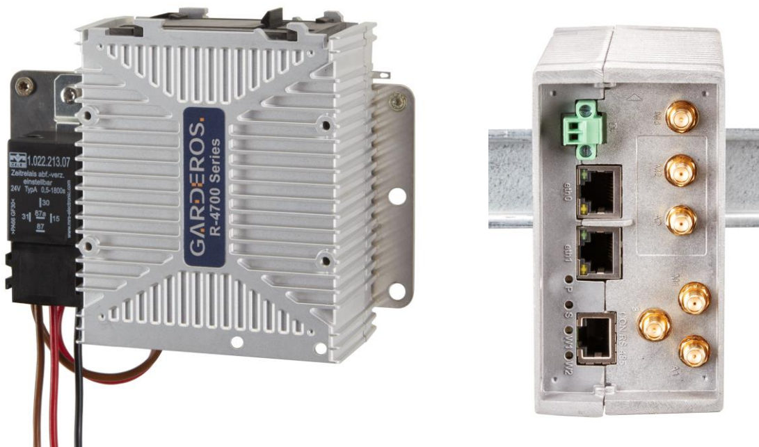
Fig. 1: Garderos R-4700 routers for in-vehicle use.

The Garderos R-4700 Series of routers are certified for in-vehicle use and provide cyber-secure and reliable data connectivity for mobile applications. The R-4700 Series routers provide 2 LAN ports and various wireless WAN interfaces such as Public Cellular and Private LTE. Configurations such as single wireless WAN or alternatively dual wireless WAN are possible. Local WiFi access is optionally possible. Due to their high processing power, the R-4700 series routers can also host virtualized container applications.