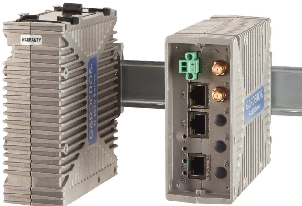
Fig. 1: Garderos R-3600 single radio routers optimized for smart grid.

Garderos routers provide cyber-secure and reliable data connectivity for large-scale router networks in telecommunications and utility networks, as well as intelligent traffic systems. The Garderos R-3600 Series routers provide 2 LAN ports and optional wireless WAN interfaces such as Public Cellular and Private LTE. Failover between a wireless WAN interface and an Ethernet port configured as a WAN port is possible.